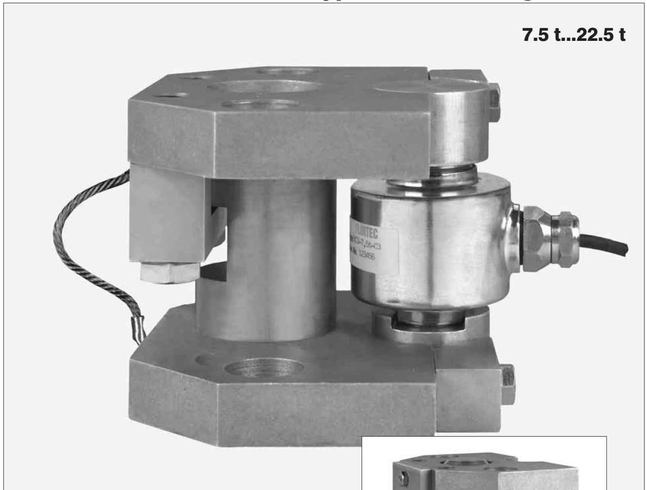
Weigh Module 55-01-10 with RC3 Load Cell