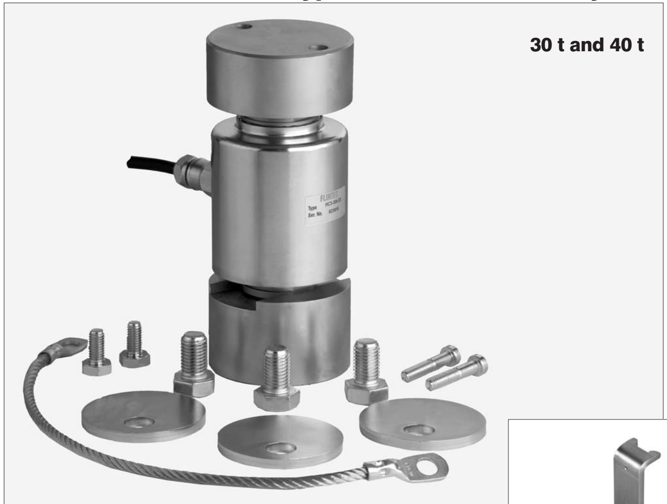
Rocker System 55-01-07H with RC3 Load Cell