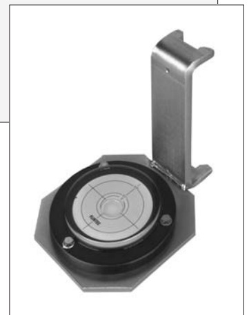
Flintec Bubble Level

Flintec load cell supports are designed to prevent unwanted forces from affecting load cell performance. The Type 55-01-07H is a self aligning rocker system, combining excellent load introduction with low profile design.