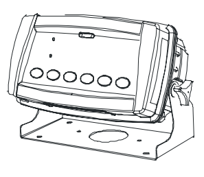
Shown with M3012 stand

Specifications are subject to variation for improvement without notice. Illustrations are indications only and variation may be evident between products